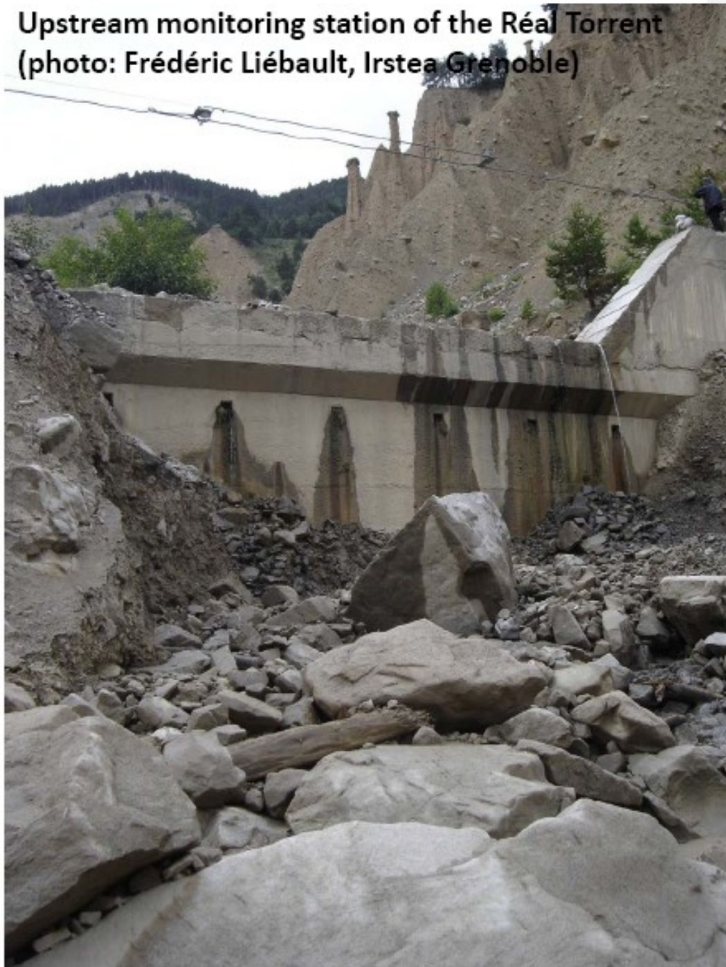
Upstream monitoring station of the Réal Torrent