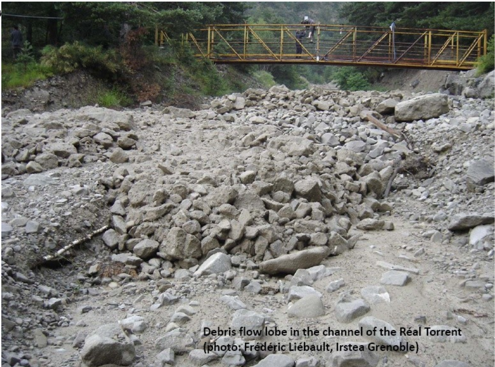
Debris flow lobe in the channel of the Réal Torrent